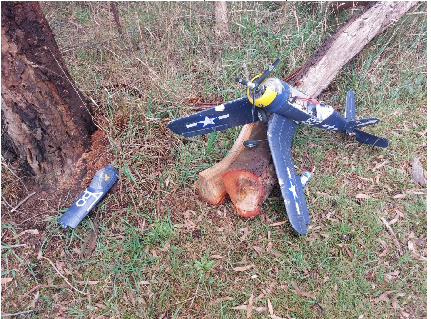
Above – Wayne’s Corsair went off the air and hit the tree 4 metres up and no it didn’t bring down that branch when it hit the tree. The tree actually saved the model from going into the Lake.