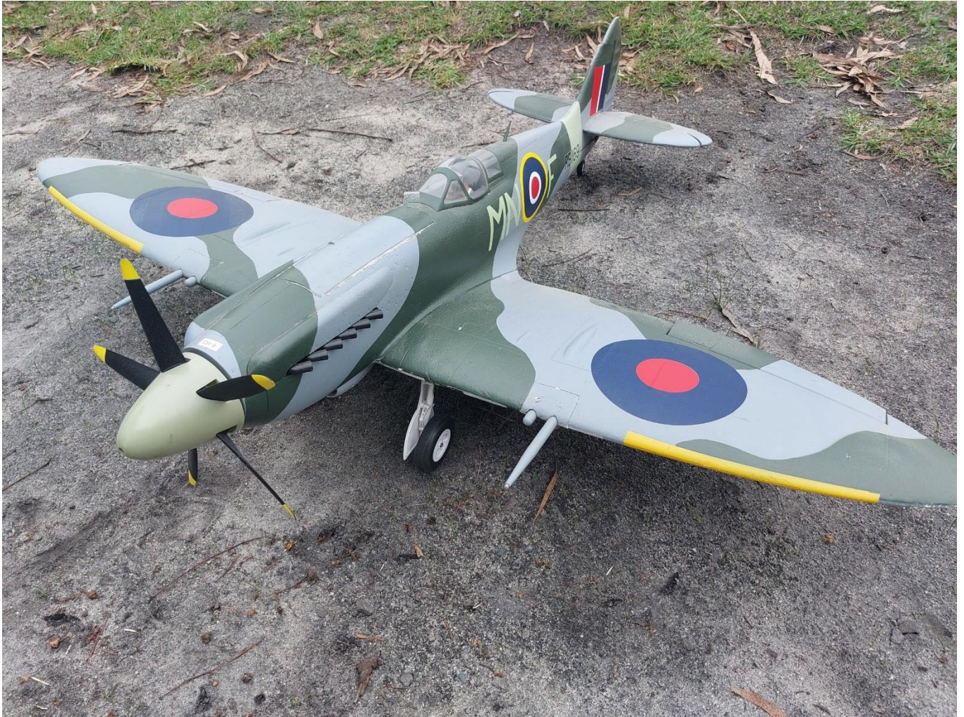
Above – Bill Reids Spitfire - 1100mm span foamie