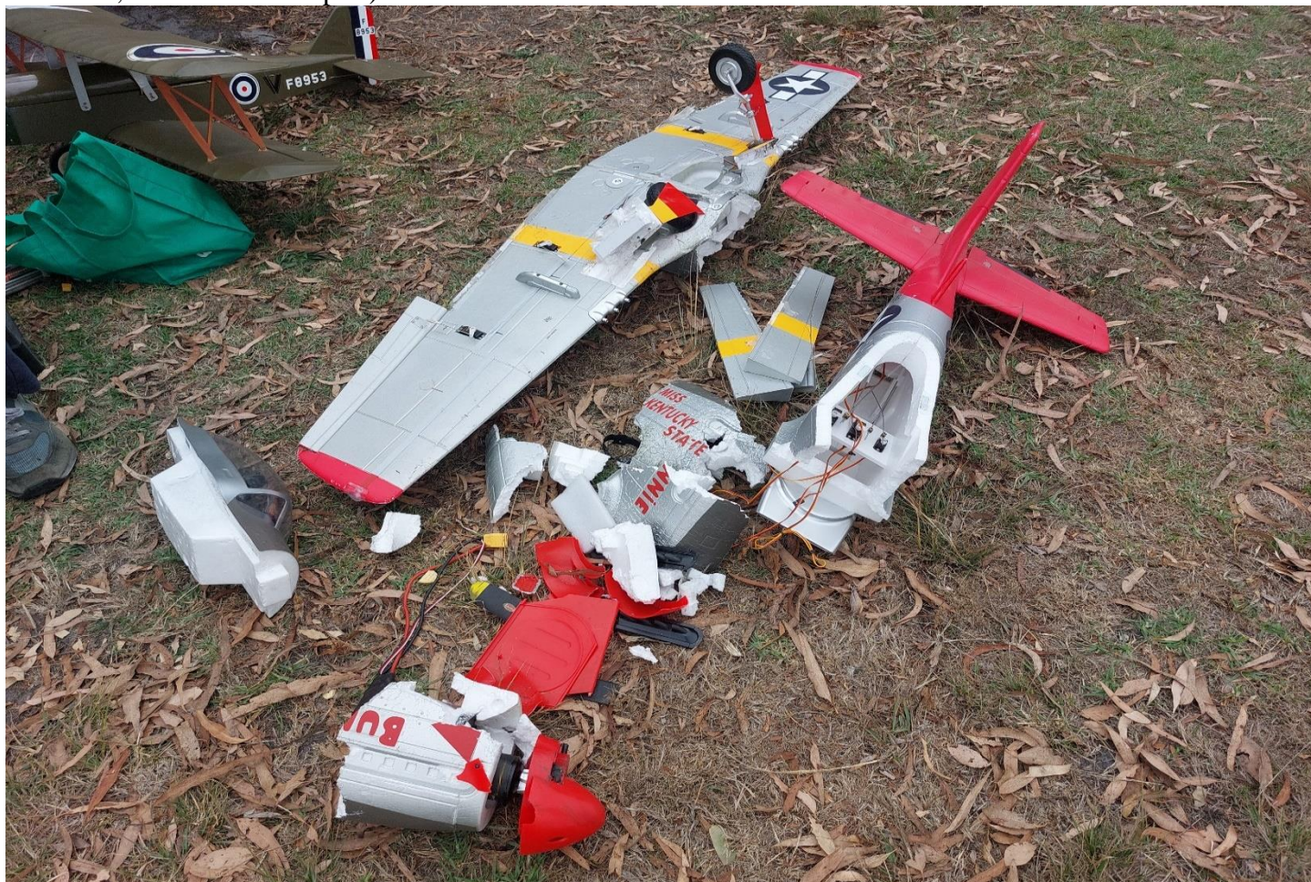
Above – Chris lost his 1700mm span Mustang when it ran out of power, possibly with a faulty ESC, before the Warbirds day

(read in conjunction with the MAAA Bronze, Silver & gold Wings Sheet as there are manoeuvres that we do not do, included in this pdf )