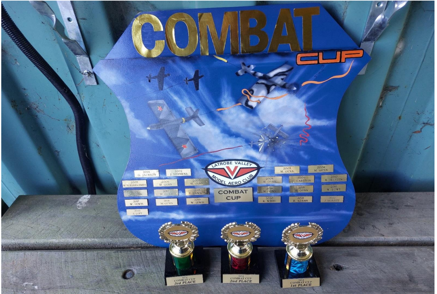
Above – the Combat Cup & Trophies