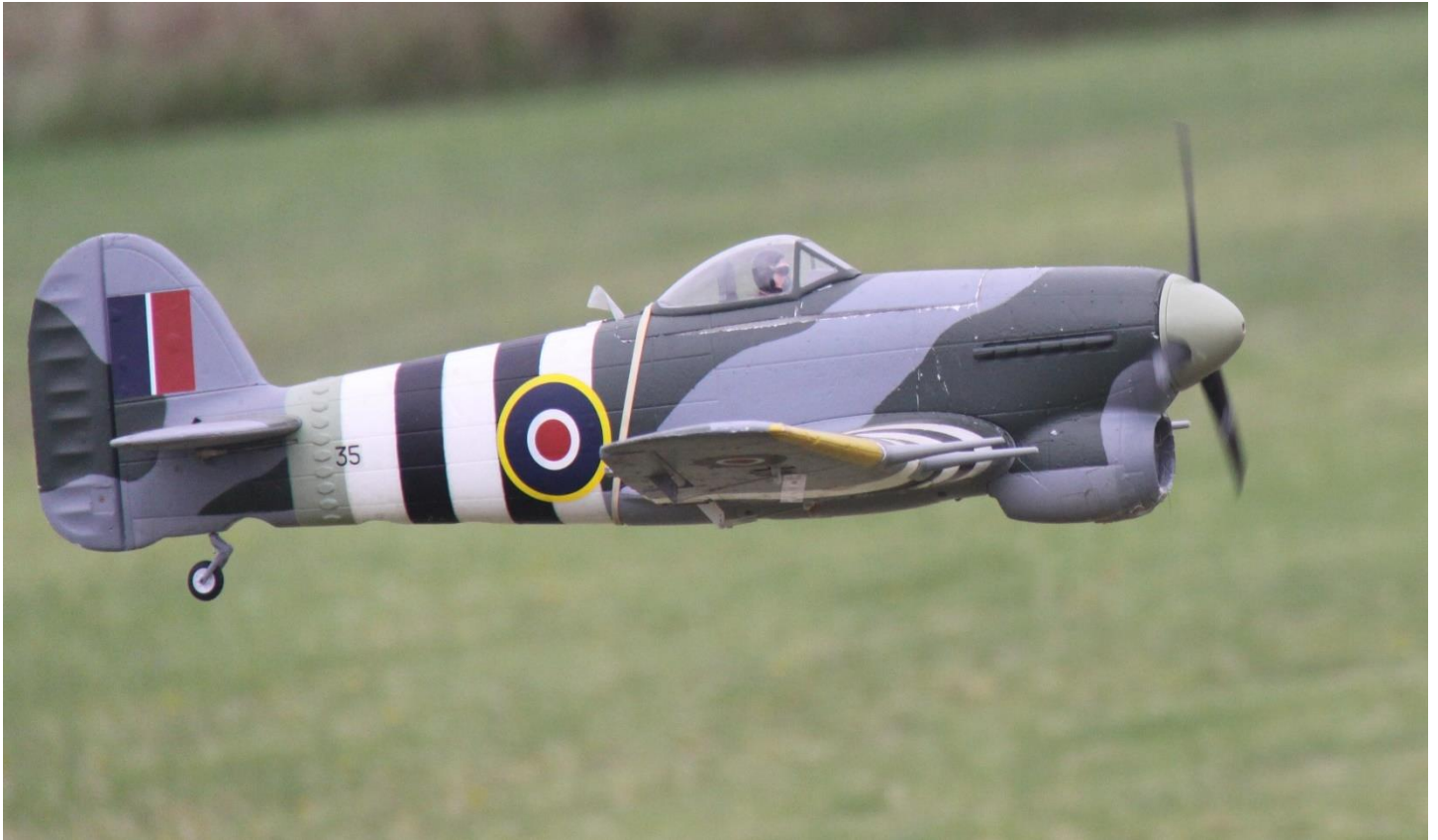
Above – Wayne Typhoon doing a low pass