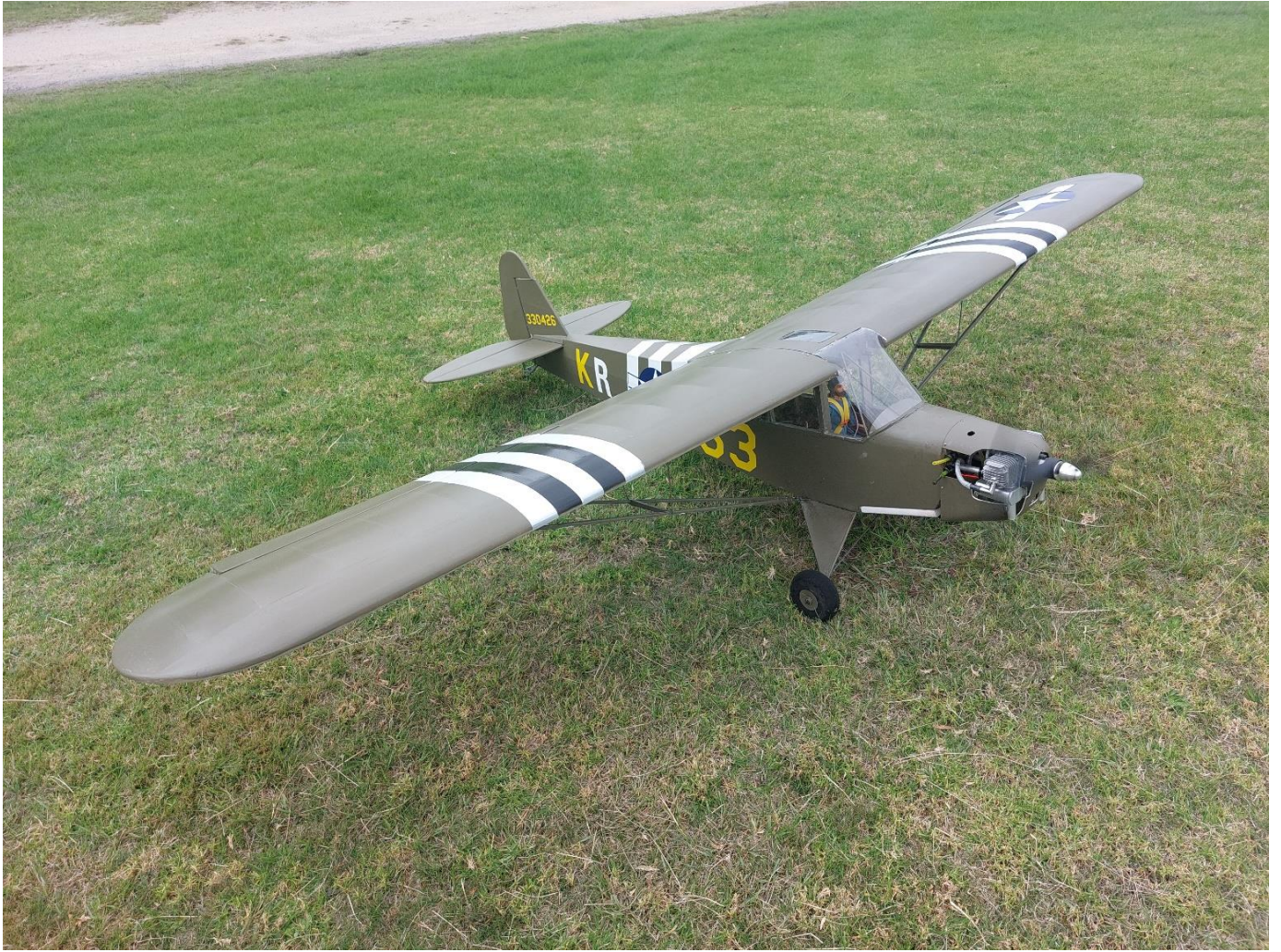
Above - Mick Dye's Piper Cub