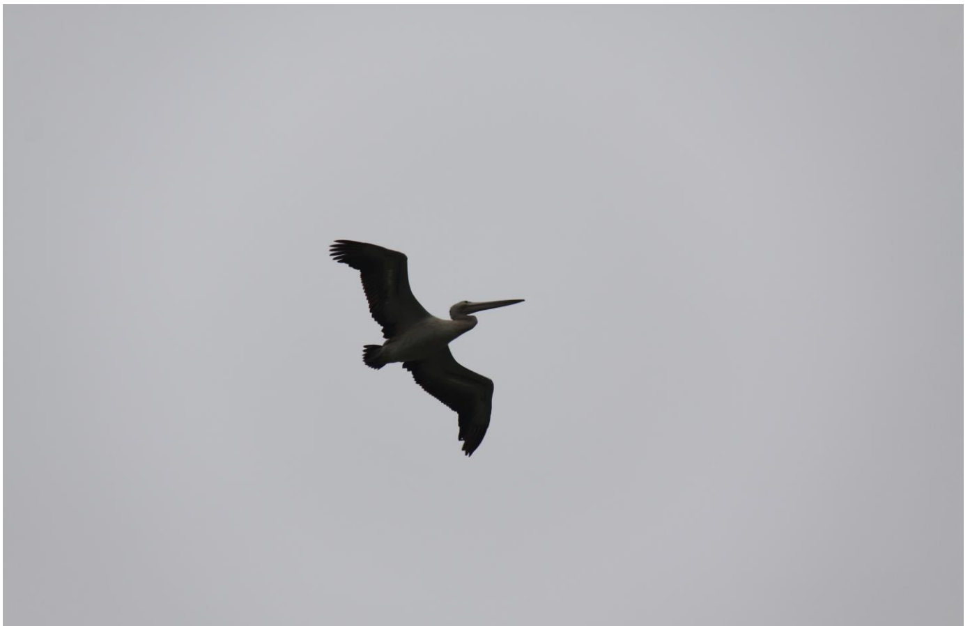
Above – Not sure who’s side this majestic flying machine was on.