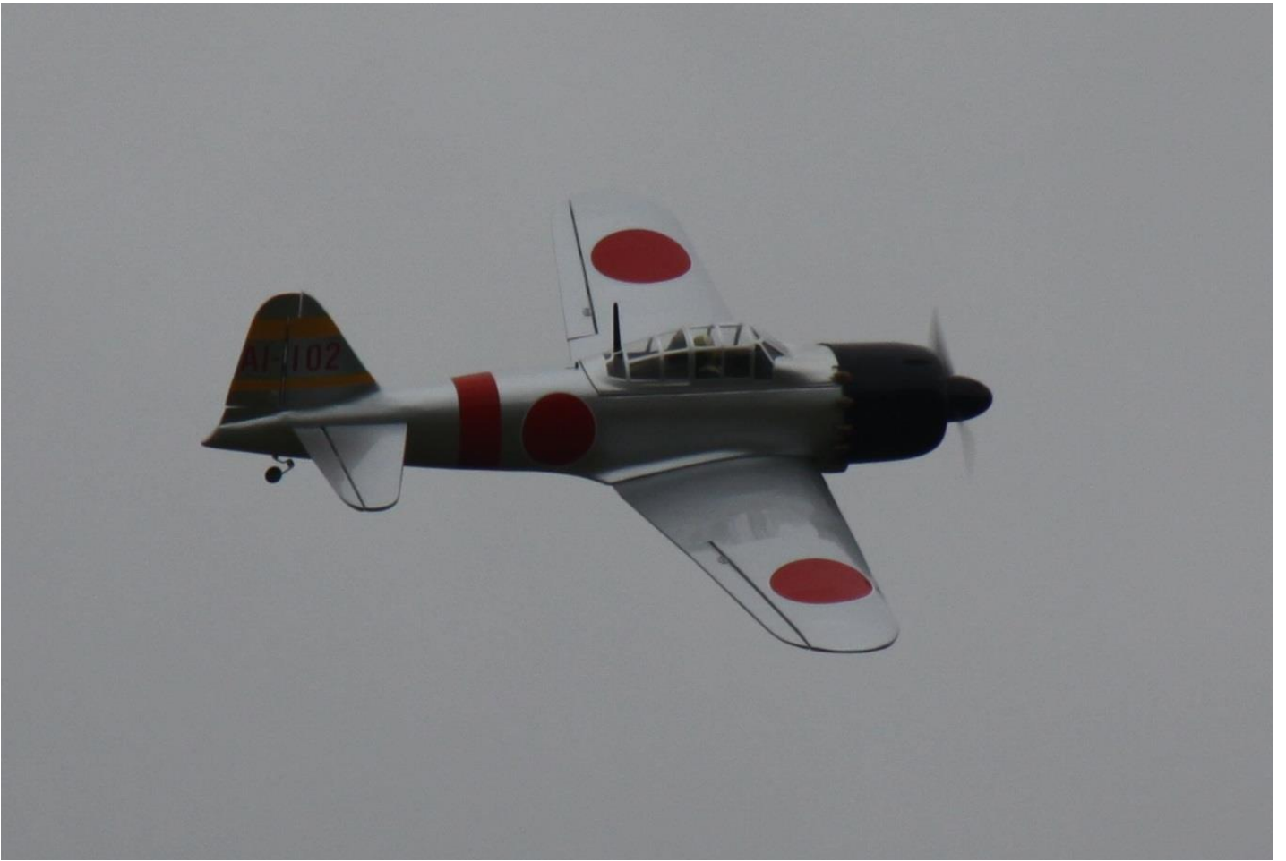
Above – Lofty’s Zero flying nicely